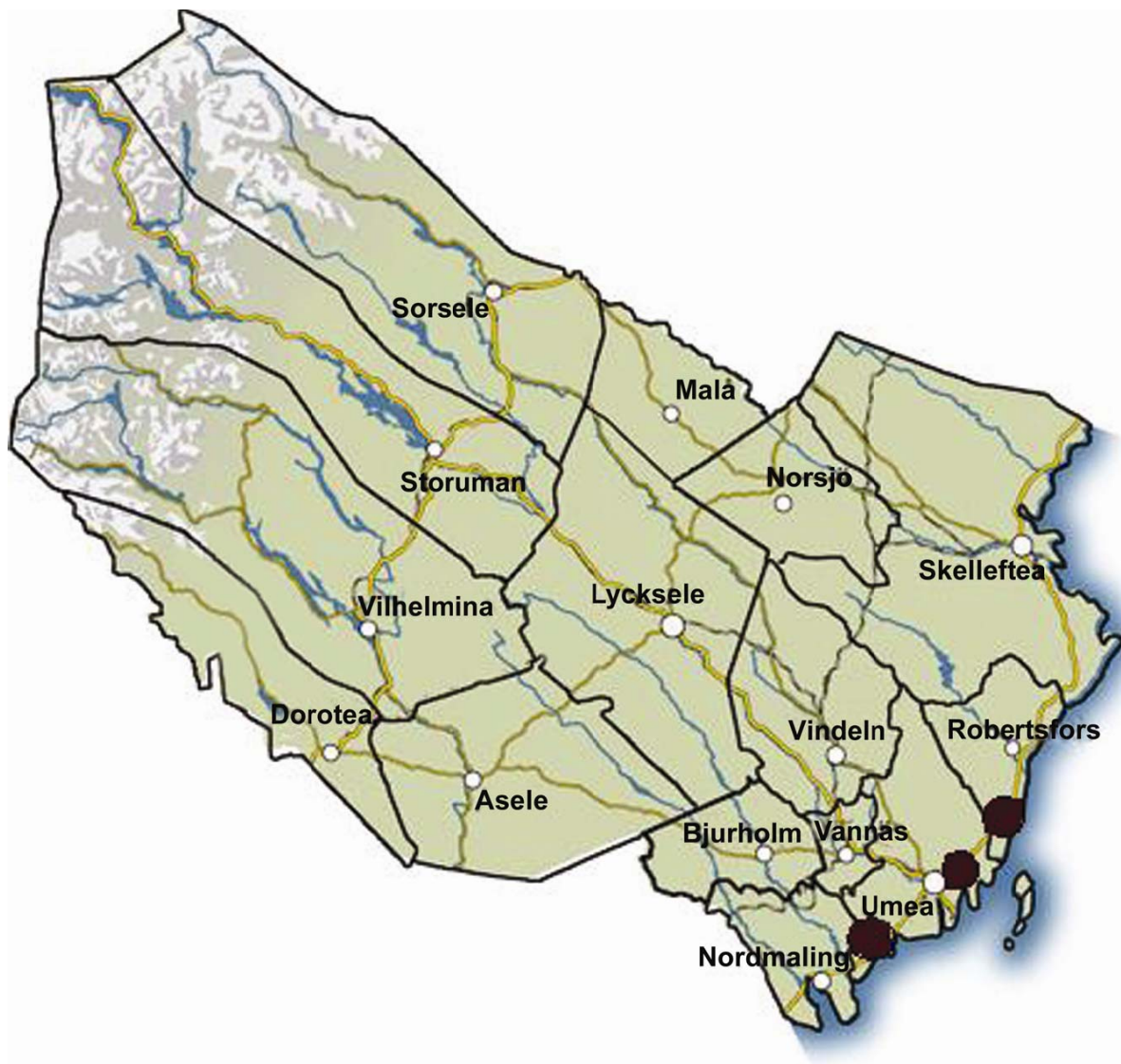
Fig. (1). Geographical locations of the study areas (▣). Each locality has two replicated sites separated by a distance of at least 10 km.

For collection of animals, 180 snap-traps baited with dry apples were set during four nights constituting 720 trap-nights per area of investigation. The animal is killed instantaneously and the bait is not consumed before death. The areas were sampled consecutively over three week periods and traps were checked early mornings once a day. The number of animals caught was transformed to an index related to number of traps and days, which is catch per unit effort (CPUE) (Hörnfeldt 1994).