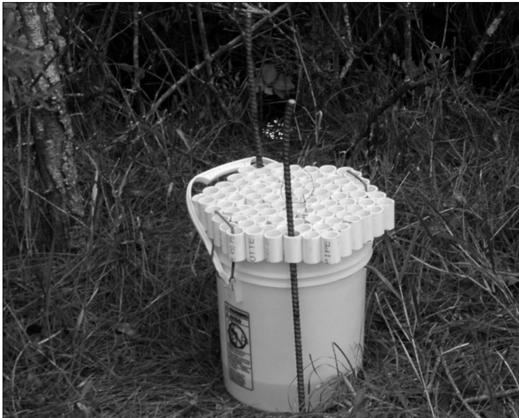
Fig. (3). A baffled-lid weevil trap secured with steel rebar at a collecting site.

1992; Fig. 3). Traps were baited with Cruentol ® (Chemtica International, Costa Rica), a synthetic aggregation pheromone, and Weevil Magnet ® (Chemtica International, Costa Rica) to simulate the volatiles produced by damaged or stressed palm tissue (Giblin-Davis et al. 1994). Each bucket was filled with 4.7 L (1 gal.) of water mixed with dishwashing detergent to quickly drown weevils caught in the trap. Two 75.6 (30 in.) sections of 1.3 cm (0.5 in.) steel rebar were used to secure the baffled lid to the trap by inserting the rebar through two outside pieces of the lid and into the ground (Fig. 3).